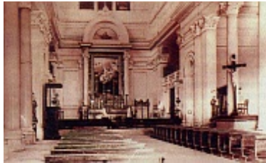
St. Joseph's Church in 1912