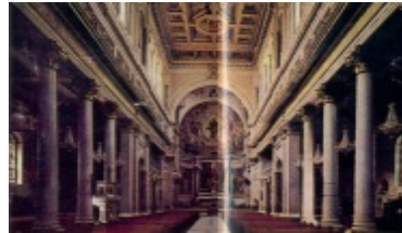
The Minor Basilica as it is today.

His beloved Pope Pius X died in 1914, one year before Fr. Guanella's death. The two saints understood each other so well.